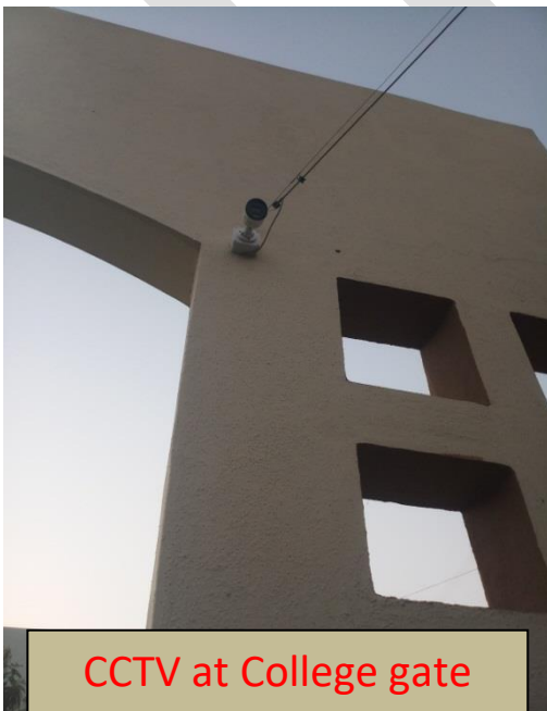
CCTV at College gate