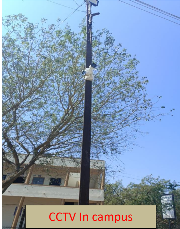
CCTV In campus