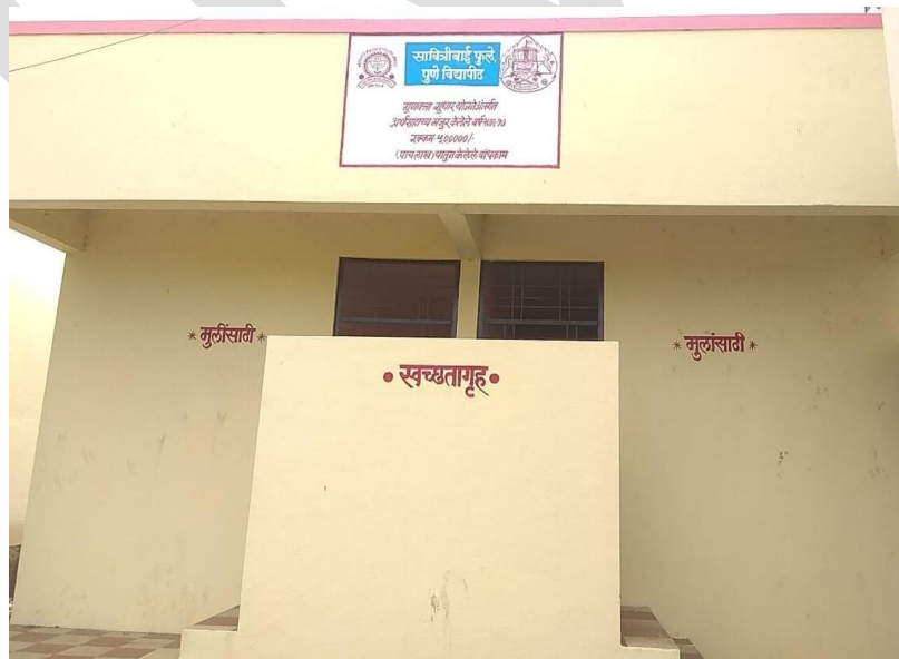
Separate Ladies Toilet facility