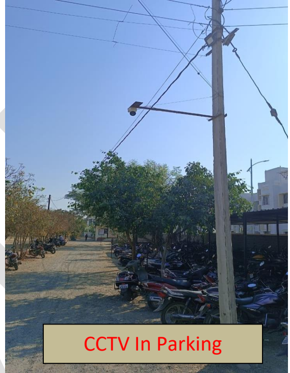
CCTV In Parking